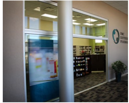
Rochester Southeast Pharmacy

507.356.2476 111 County Road 11 Pine Island, MN 55963 Hours: Monday to Friday 8:00 AM – 5:00 PM