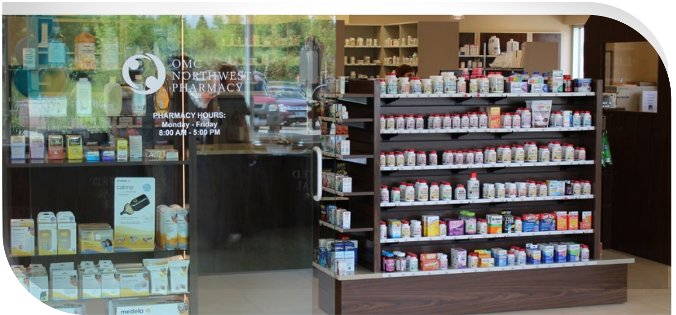
Rochester Northwest Pharmacy