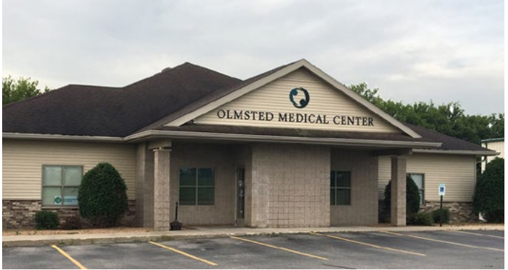
Olmsted Medical Center - Pine Island

Southeast Clinic, please call 507-288-3443.